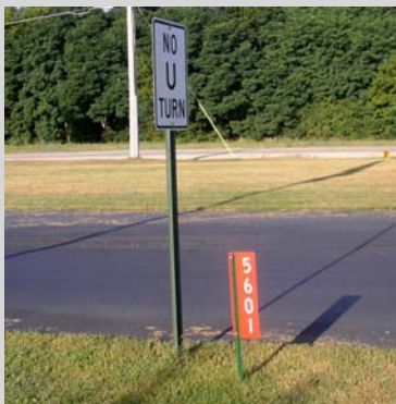
This picture shows the red sign in front of our fire station. The sign is highly illuminated at night for easy sight access. This helps us to find you faster during night time emergencies.

If we can't find you, we can't help you. The Richmond Twp. Firefighters Association has begun a new project to offer the residents of our fire district an address marker sign for their residence.